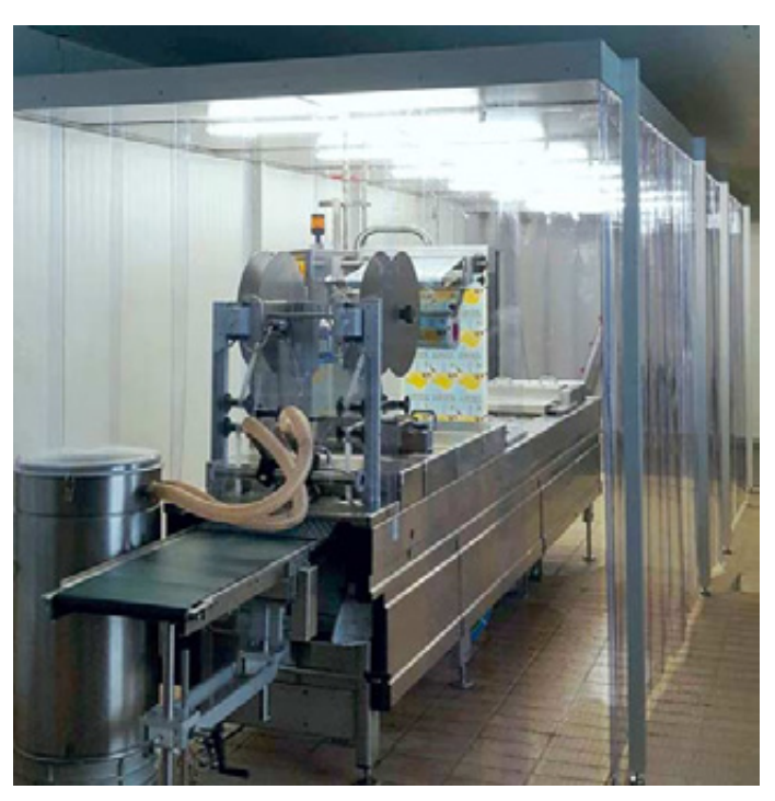
Packing of organic spread. CleanFlowCell® laminar flow housing, clean room class ISO-7.

Product safety at the highest possible level offered by CleanSteriCell® closed clean room systems, developed for the strict requirements of the pharmaceutical industry. These are a free-standing "room in room" system usually installed within production buildings. Using a built-in air circulation process within the clean room walls and a permanent air exchange, constant particle cleanliness, temperature, humidity and pressure conditions can be maintained throughout the room. Employees can only enter the clean room through lock systems and with suitable clean room clothing. Microbiological