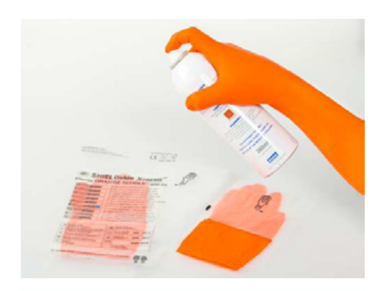
SHIELD Scientific B.V D 84184 Tiefenbach