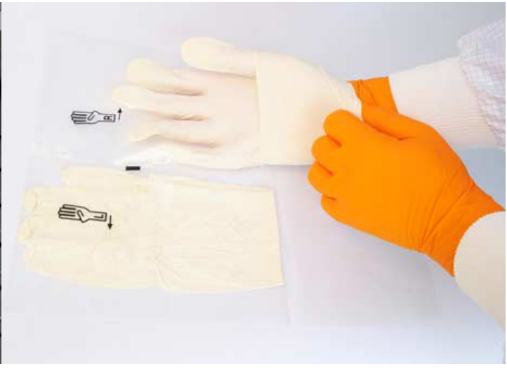
Clean room nitrile gloves

Validation of any glove used in a cleanroom is typically a long and demanding process. In the face of an increasingly stringent environment, the needs for disposable gloves have changed dramatically. Two decades ago it was common practice to accept standard gloves in PE packaging for use in the cleanroom. Likewise vinyl gloves were widespread particularly in the micro-electronics industry, but a better understanding of the contamination and barrier issues posed by these types of glove have largely contributed to their disappearance. Meanwhile, in the pharmaceutical industry, the practice of using standard surgical gloves (i.e. those where the wallets and outer packing are both made of paper) continued even in aseptic environments.