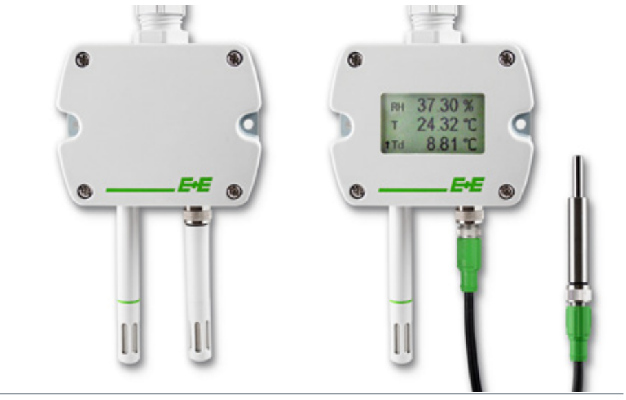
Figure 1: EE211 Humidity and temperature transmitter with heated sensing probe.

The EE211 calculates the dew point temperature (Td) based on the RH and temperature values measured by the heated humidity probe. A separate, interchangeable temperature probe measures the ambient temperature (T). From Td and T the EE211 calculates back the ambient relative humidity as well as additional physical quantities like absolute humidity, mixing ratio, wetbulb temperature or specific enthalpy.