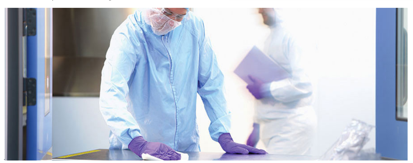
cleanroom online - page 3/14 - edition INT 08-2016

E-Mail: emily.buck@ecolab.com Internet: http://www.ecolabcc.com/