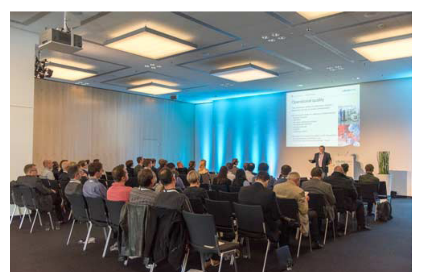
Cleanzone Congress offers valuable information on the entire life cycle of a cleanroom