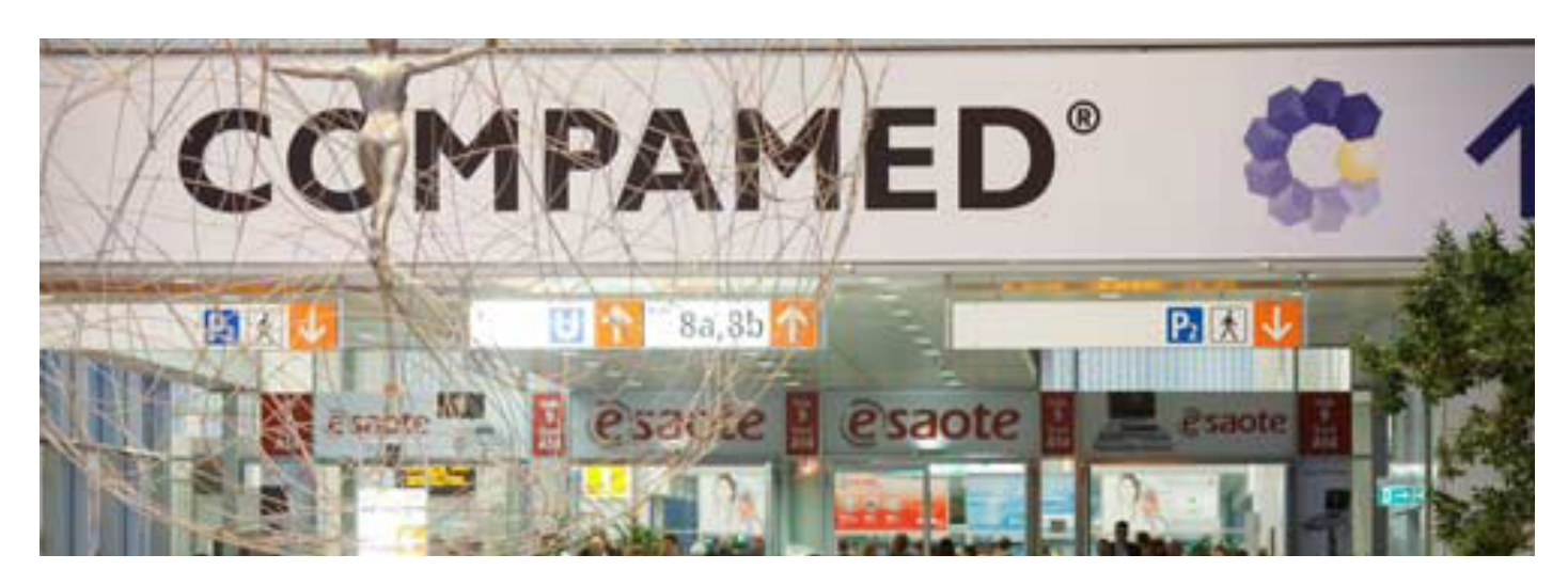
Expert forum focuses on the megatrend of personalised and individualised medicine